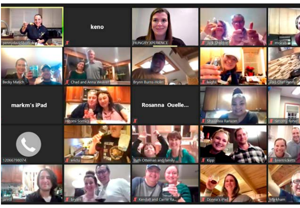
Am I Hungry? is an online mindful eating program that offers training, coaching, and other resources to help people recognize and take charge of the eating decisions they make everv dav.

Vitality is a comprehensive, interactive, and personalized program that helps employees improve or maintain health by providing knowledge and tools to establish and meet health goals. When employees participate in healthy activities, they can earn Vitality Points which are redeemable for merchandise and other great rewards.